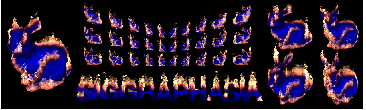
Figure 1: Ignited bunnies seen from different views. With the fire’s density field ( \phi ) resolution set to 768 \times 768 and the velocity field’s ( \mathbf{u} ) resolution set to 192 \times 192 , the animations run on the GPU at more than 1000 frames per second.