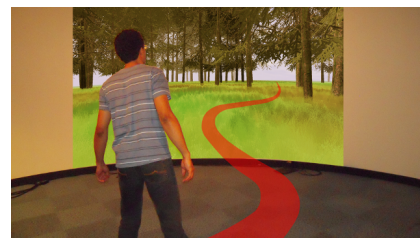
Figure 1: Slalom navigation in a Virtual Environment.

The Walking-In-Place (WIP) technique [SUS95] has been introduced to enable a real physical walking movement during virtual navigations. With WIP, the user can move infinitely inside the VE by consciously walking in place in the real world. The motions of the user’s body are tracked and analyzed to be converted into inputs for the