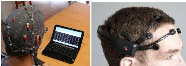
Left: IntendiX running on a laptop and user wearing the active electrodes. Right: dry EEG technologies by Emotiv.

Due to the recent advances and increased interest in BCI technologies, several companies are now commercializing BCI products. Such products range from high quality and expensive systems for scientists and medical applications, to cheap low-end devices for the general public. Among them, we can mention the IntendiX® (g.tec medical engineering GmbH, Austria, www.intendix.com ), which is a complete BCI solution for spelling dedicated to patients at home. At the other end of the spectrum, we can mention the BCI devices provided by Neurosky ( www.neurosky.com ) or Emotiv ( www.emotiv.com ). Those companies provide cheap dry sensors technologies together with dedicated software, mostly for gaming applications. It should be mentioned, however, that due to the sensors location in those systems, they most likely also measure and use muscle activity (ElectroMyoGram – EMG) and thus might not be considered a pure BCI (see, e.g., http://spectrum.ieee.org/consumer-electronics/gaming/loser-mental-block/0 ). Independently from this definition, from an application point of view, using EMG together with EEG signals could prove useful and rewarding.