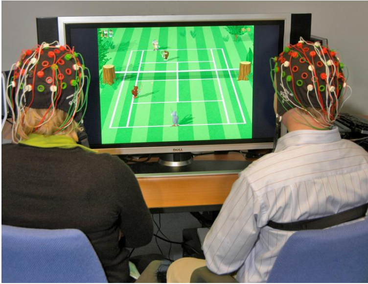
Fig. 2. Gaming is considered an important application area of non-medical BCIs. Brain control results in the development of new games but can also add to the fun factor of existing games.