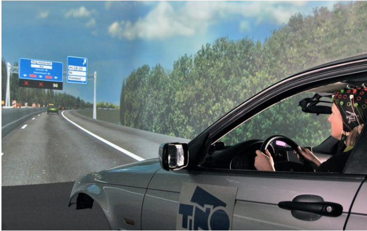
Fig. 3. Brain signals can be used to monitor for instance driver workload or to evaluate in-vehicle systems that may interfere with the primary driving task.