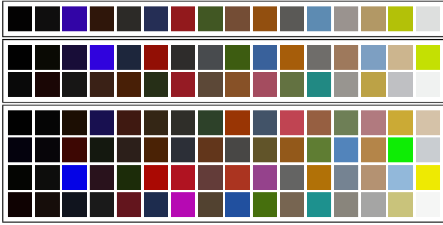
Figure 1: Color dictionaries learned by our procedure for k_c = 16, 32, 64 . Best viewed in color.

Lab 1 color space in all our methods. This space is preferred to, e.g., the opponent space because it is more consistent with the Euclidean space structure, in particular the color dictionary generation procedure, which is based on k-means.