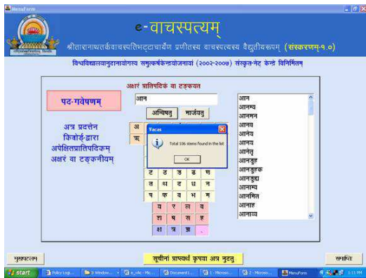
Figure 3: Word-Index