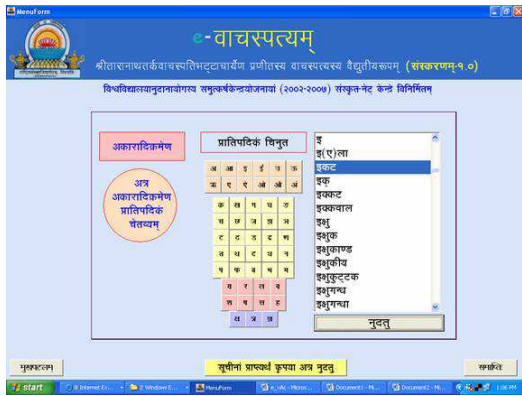
Figure 2: Alphabetical-index