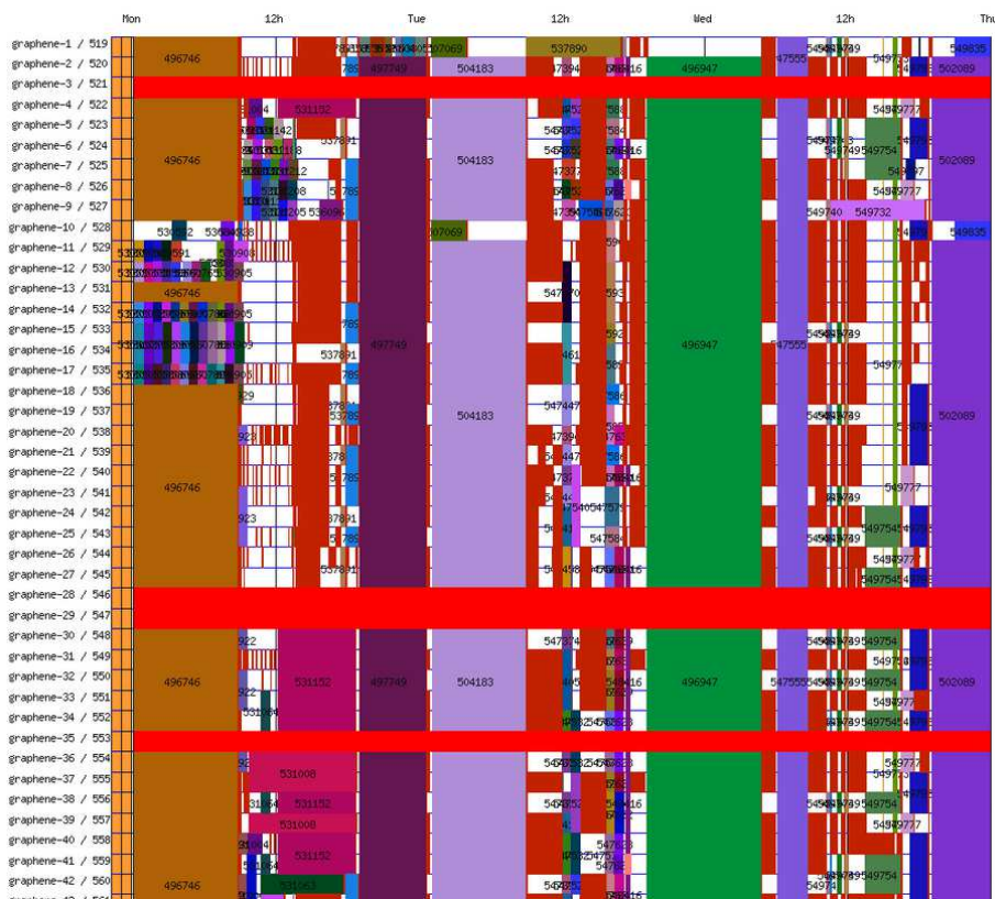
Fig. 5. Visualization of the usage of a Grid'5000 site using a Gantt diagram.

other hand, with OAR, each node can be associated with a number of properties, that can later be used to request resources fulfilling specific needs, as shown in Figure 4. This enables users to request resources matching specific properties, rather than rely on explicit naming of requested resources: the burden of filtering resources for specific user requirements is transferred from the user to the resource manager.