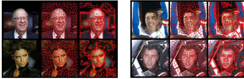
Fig. 3. Examples of superpixels. The left column is the original image, the middle column is the Mori segmentation ( N_{sp}=100 , N_{sp2}=200 , N_{ev}=40 ), and the right column is the Felzenszwalb-Huttenlocher segmentation ( \sigma=0.5 , K=100 , \min=20 ).

Alignment. To create an aligned version of our database, we used an implementation of the congealing and funneling method of Huang et al. [12]. 7 We took one image each of 800 people selected at random to learn a sequence of distribution fields, which we then used to funnel every image in the database.